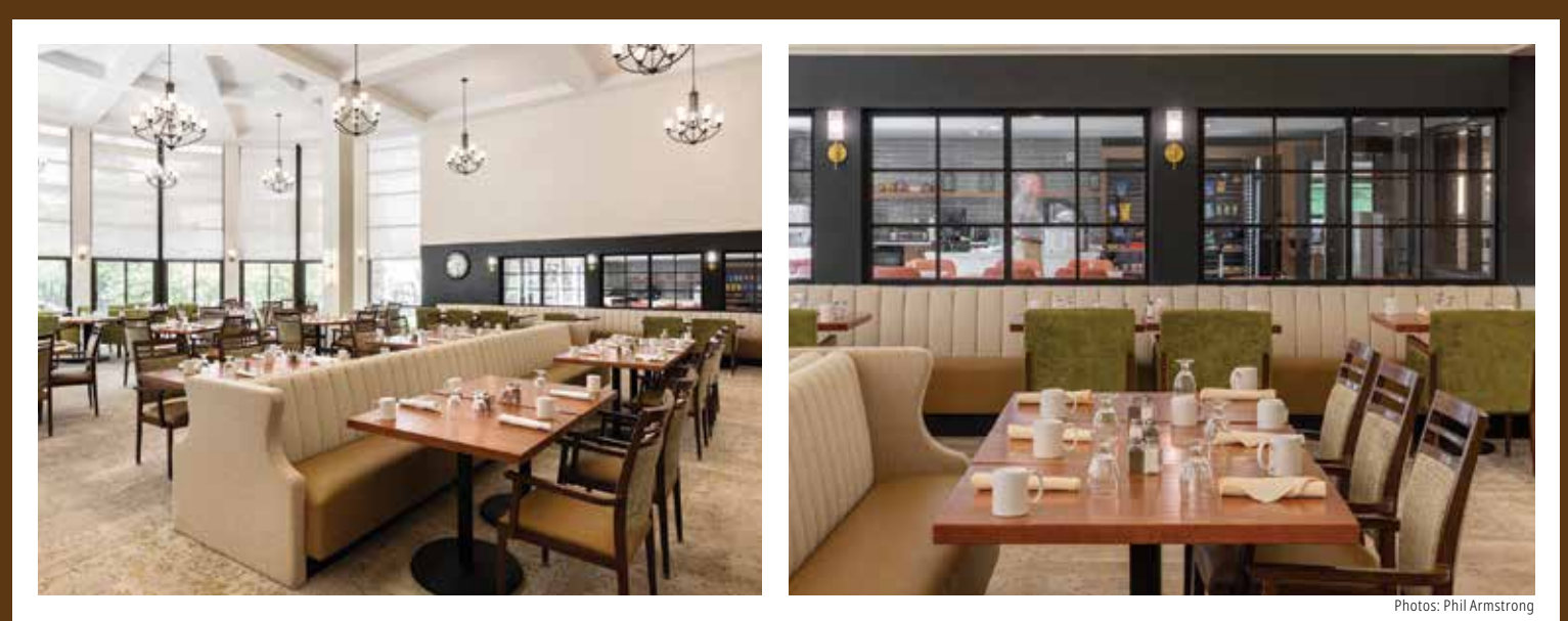
Bellbrook Life Plan Community in Rochester Hills

Bellbrook was looking to refresh their outdated and dark amenity spaces. The main dining room was transformed into a light and inviting den that morphs into a more sophisticated dining space as day turns to night, while the adjacent café serves as a welcoming and convenient experience for residents.